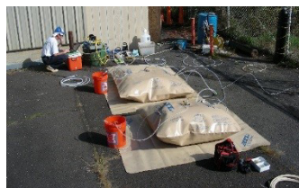
NAWC Trenton Bioaugmentation Pilot Study

Bioaugmentation. A pilot study was implemented at the NAWC Trenton site in 2005 to evaluate whether bioaugmentation would be successful at reducing concentrations of TCE and associated daughter products.