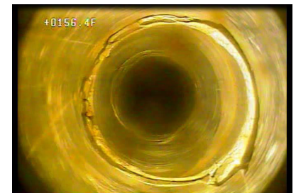
Video Image of Borehole Showing Fracture

Geophysical imaging was performed in each open hole boring using the following methods: video profiling, caliper logging, natural gamma logging, fluid and temperature resistivity logging, and acoustic televiewer logging. In addition, a heat-pulse flowmeter (HPFM) was used to identify the presence, magnitude, and direction of fracture flow. Results from the geophysical imaging, coupled with the borehole logging and rock core analysis, were used to identify depths of water-bearing fractures and potential VOC contamination for subsequent discrete depth sampling, which was performed using a straddle packer system. Discrete-depth groundwater samples were collected from up to seven depths per borehole and analyzed for water quality parameters, geochemical parameters, VOCs, and dissolved metals. Microbial analysis and compound-specific isotope analysis (CSIA) also was performed on the samples. In addition, discrete depth groundwater samples were collected from adjacent existing monitoring wells with long open intervals. Groundwater sample analysis results were used to identify treatment depths and to design the ISBGT amendment formulation.