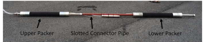
Straddle Packer System Used for Groundwater Sampling

bgs as an open hole completion. Continuous 5-ft cores were collected and logged by a licensed geologist, screened with a photoionization detector, and wrapped with FLUTE™ liners to evaluate the presence of NAPL. Rock core samples were collected from discrete depths coinciding with evidence of NAPL staining, lithologic contacts, and/or fractures, and submitted for VOC analysis using microwave-assisted extraction, gas chromatographic (MAE GC) methods. Rock core samples also were analyzed for magnetic susceptibility, x-ray diffraction (XRD), scanning electron microscopy-energy dispersive spectroscopy (SEM-EDS), and optical imaging.