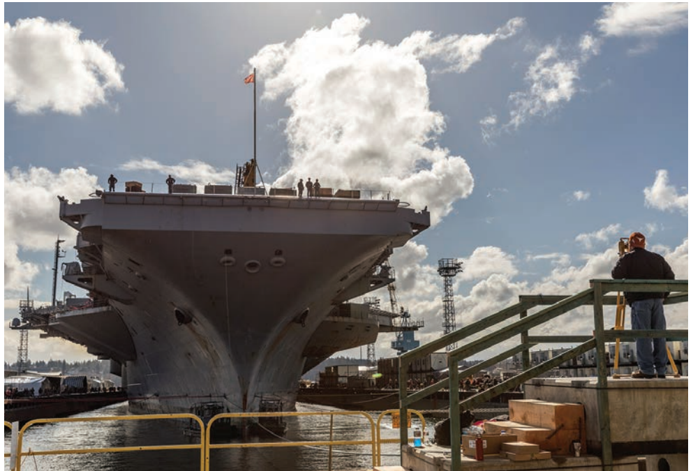
A ship enters drydock at Puget Sound Naval Shipyard (PSNS) and Intermediate Maintenance Facility (IMF). PSNS&IMF must monitor the levels of copper and other contaminants in shipyard effluent.

To satisfy NPDES compliance, there is a need for a fast, easy-to-use tool to differentiate between forms of copper in shipyard effluent. The goal of this project is to demonstrate a methodology for rapid quantification of copper in seawater using an optical detection system. This project team will explore an innovative technology that uses fluorescence and a laser system for copper quantification. Light-reflecting copper complexes are illuminated when fluorescently activated copper ions pass through a green laser diode, producing an optical signal that corresponds to the copper concentration.