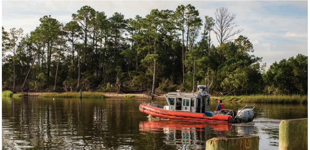
Gathering water samples is typically slow, cumbersome and labor-intensive.