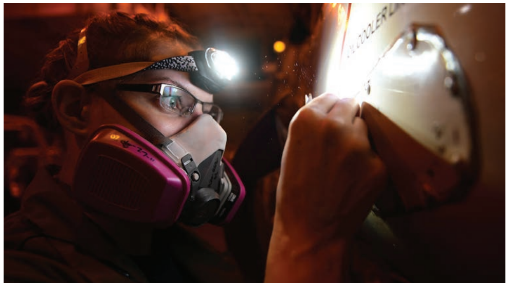
An Aviation Electronics Technician prepares an F/A-18E Super Hornet for priming and painting.

This project team is exploring the use of two alternative solvent-borne primers: a single-component formula and a two-component formula. The goal is to qualify these to the performance requirements associated with MIL-PRF-23377 (PRIMER COATINGS: EPOXY, HIGH-SOLIDS, Type I/II Class N (non-chrome)) which will allow for their use at Navy aircraft maintenance facilities.