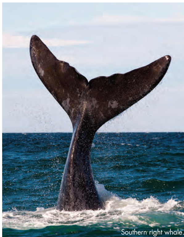
Southern right whale.

The presentations all reflected the good progress researchers have made despite the challenges that COVID has continued to pose.