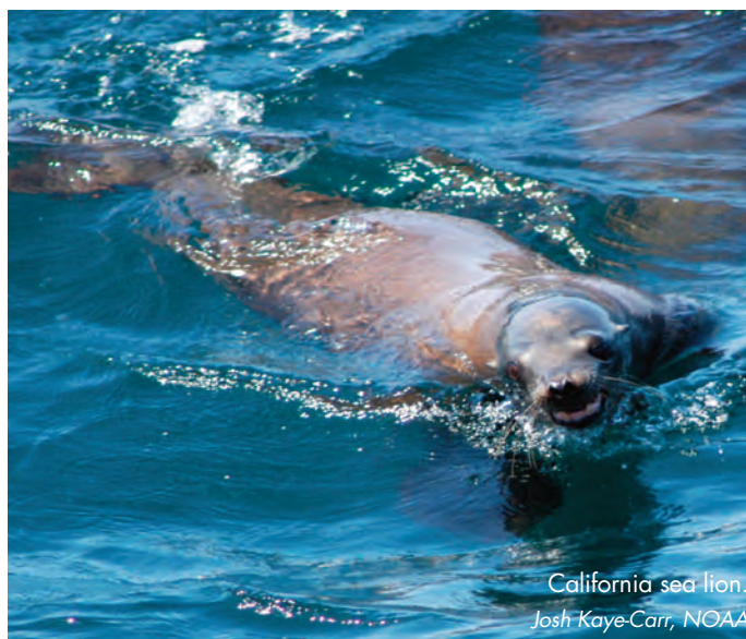
California sea lion.