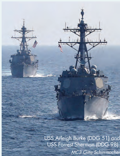
USS Arleigh Burke (DDG 51) and USS Forrest Sherman (DDG 98).

After reviewing the literature to identify frequently used detectors and descriptions of sonar signals, the team collected a set of detectors and data sets to test. The work included learning the details of each detector, standardizing formats for inputs and outputs and coordinating with detector developers on verifying detections within the data used for testing. In addition to using unclassified data for