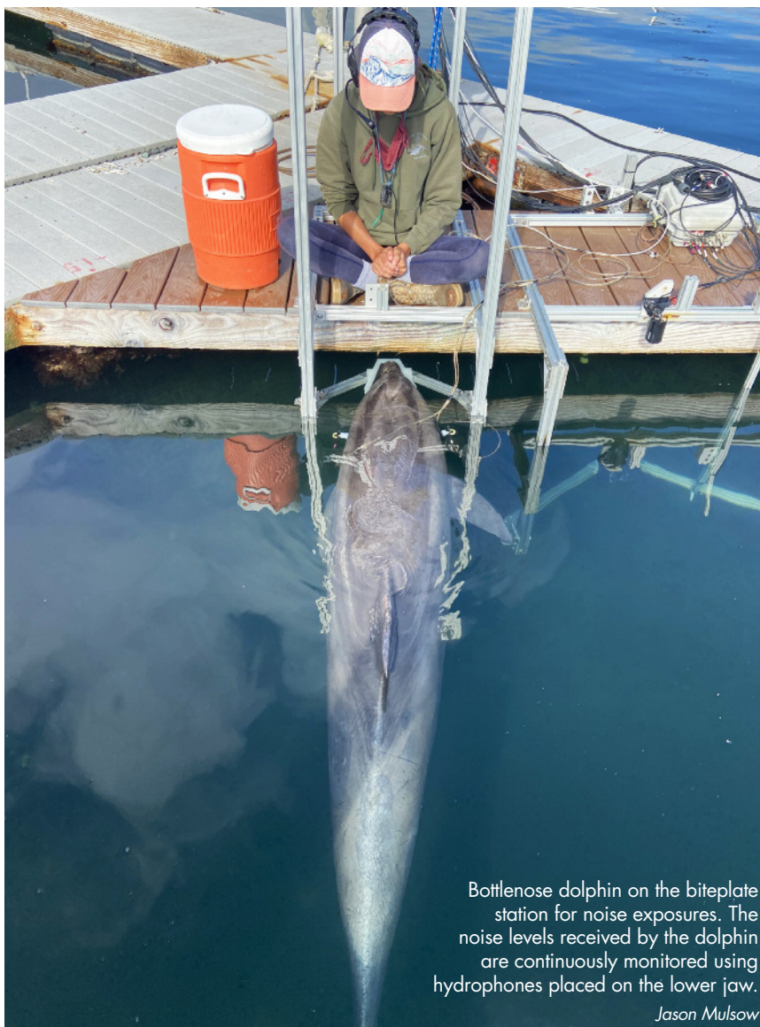
Bottlenose dolphin on the biteplate station for noise exposures. The noise levels received by the dolphin are continuously monitored using hydrophones placed on the lower jaw.

For tests to determine noise levels, the dolphins will be trained to position themselves on a second underwater biteplate for noise exposures. Testing at 28 kHz will be completed before testing at 3 kHz begins. Following pre-noise hearing tests, the noise levels will start near the hearing threshold and be slowly increased over many sessions to train the dolphins to tolerate noise exposures while remaining on the biteplate. They will be intermittently reinforced with